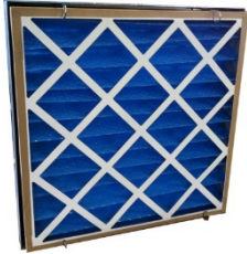
Front Withdrawal Frame (1810)

See Catalogue Section 8 (code AC8) for full information.