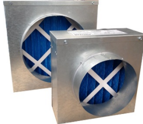
Duct Mounted Filter Housing (1825)