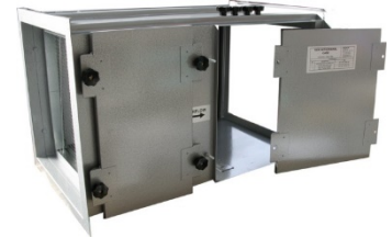
Fully Welded Side Withdrawal Filter Housing (1840)