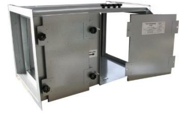
Fully Welded Side Withdrawal Filter Housing (1840)