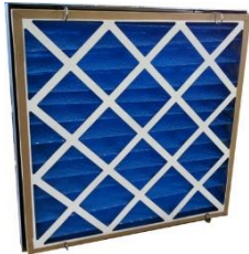
Front Withdrawal Frame (1810)

See Catalogue Section 8 (code AC8) for full information.